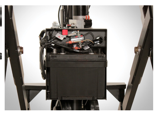
Electric lift by 12V DC hydraulic power pack (Electric model)