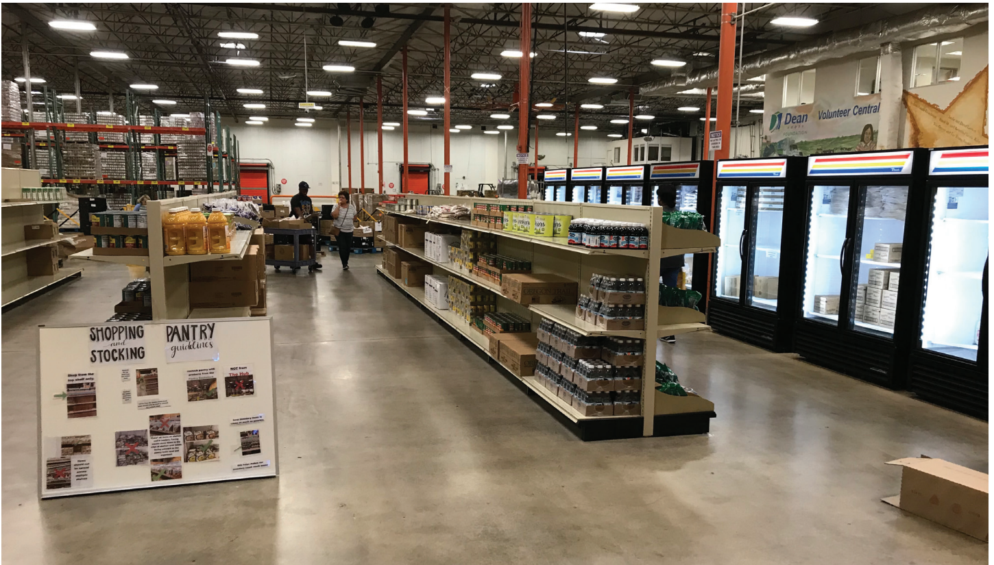
Located in Dallas, Crossroads Community Services optimized one-way shopping lane features 110-120 SKUs and eliminates the need for shoppers to backtrack for missed items.